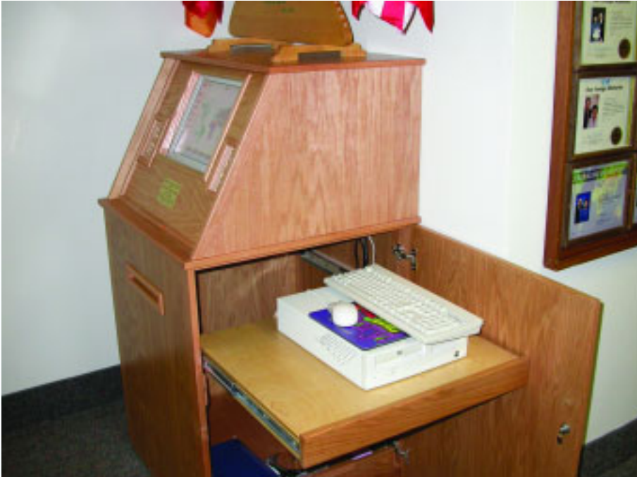
First Assembly of God - Aurora, CO (Built from included plans)